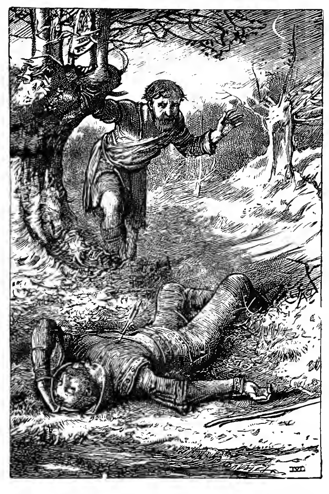
The Finding of the Body of Roufus.